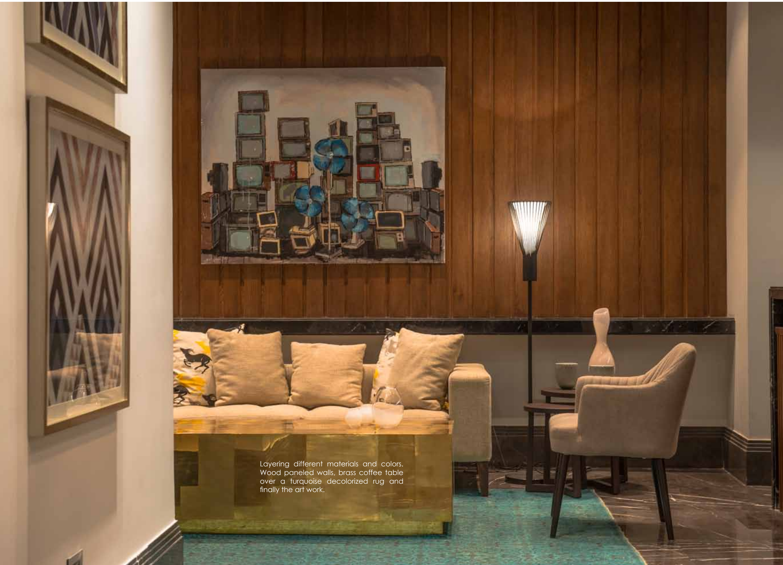
Layering different materials and colors. Wood paneled walls, brass coffee table over a turquoise decolorized rug and finally the art work.

room has at least one window looking outside, including the room designated for a live-in-maid. This is as it should be. The windows are large inviting the outside in. The kitchens are not the open American style, but rather a traditional kitchen that can be closed. This they feel is important because of the Egyptian style of cooking and entertaining. A closed kitchen does not allow the strong smells to invade the rest of the house. Importantly, every kitchen has very good ventilation and windows that look onto the garden bringing in light and fresh air.