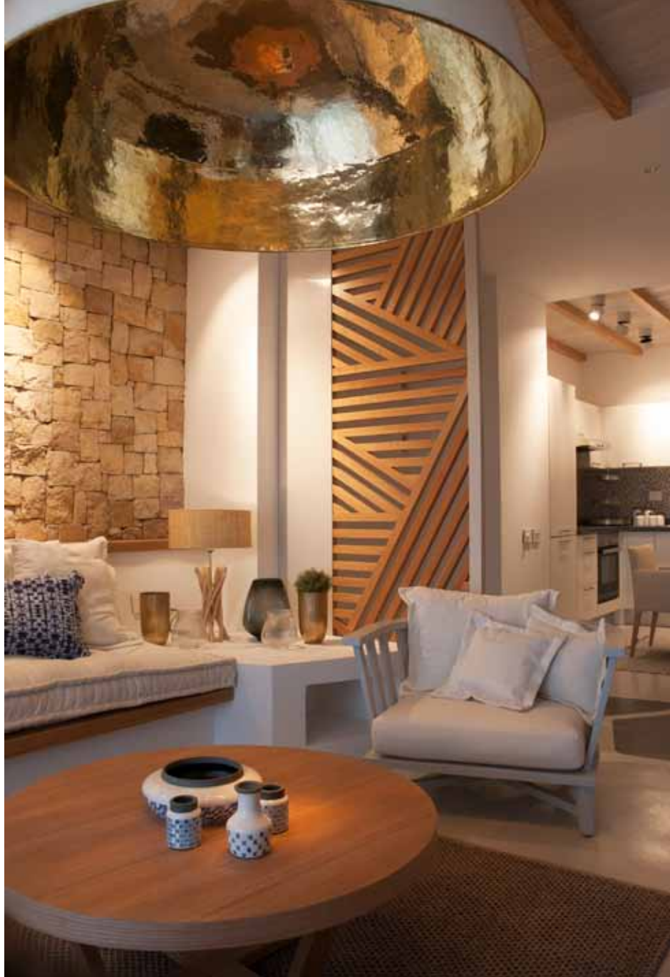
Left: Gouna apartment – KH studio custom designed and executed all furniture in this apartment. They used light tones and different textures which makes it an ideal weekend getaway.